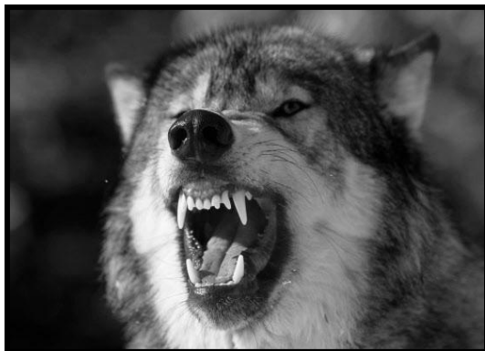
Gray Wolf (carnivore)