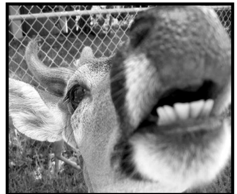
Mule Deer (herbivore)